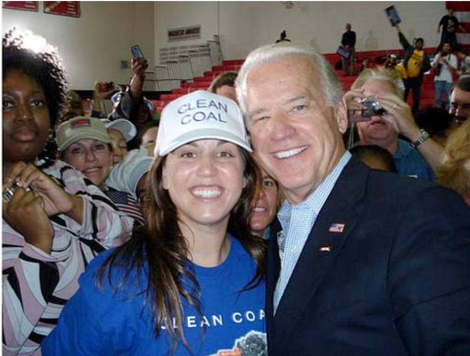
Then-Senator Joe Biden with ACCCE street team member